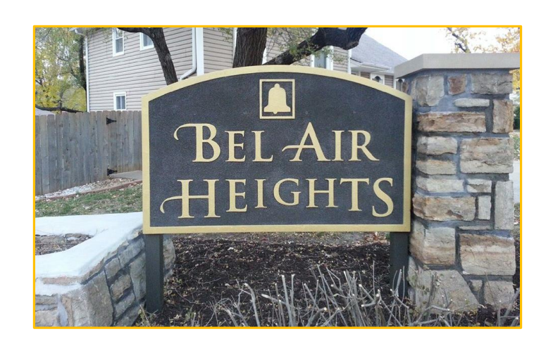
June 21, 2016